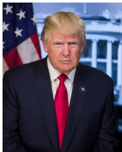
Donald J. Trump President Of The United States Of America Term Expires: 1-20-2021