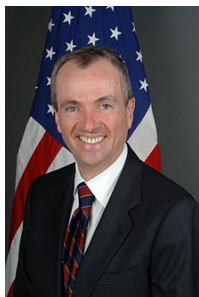
Phil Murphy New Jersey Governor Term Expires: 1-16-2022