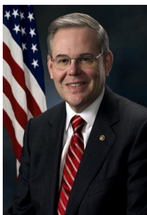
Robert Menendez U.S. Senator for New Jersey Term Expires: 1-3-2019