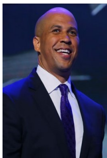
Cory Booker U.S. Senator for New Jersey Term Expires: 1-3-2020